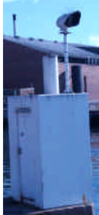
Q.R. Light on white square Concrete tower (4.7.25)